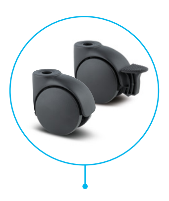
Different wheel treads

Noise-reducing soft wheel version is made of thermoplastic rubber. Hard wheel version, with a polyamide tread, also available.