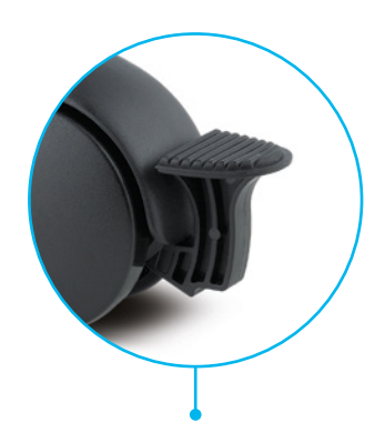
User friendly brake pedal

Castors with silver finish are also available.