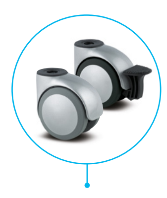
Aluminium painted version

Noise-reducing soft wheel version is made of thermoplastic rubber. Hard wheel version, with a polyamide tread, also available.