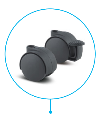
Classic reliable design

These classically designed castors offers a big colour range. Customised colours also possible.